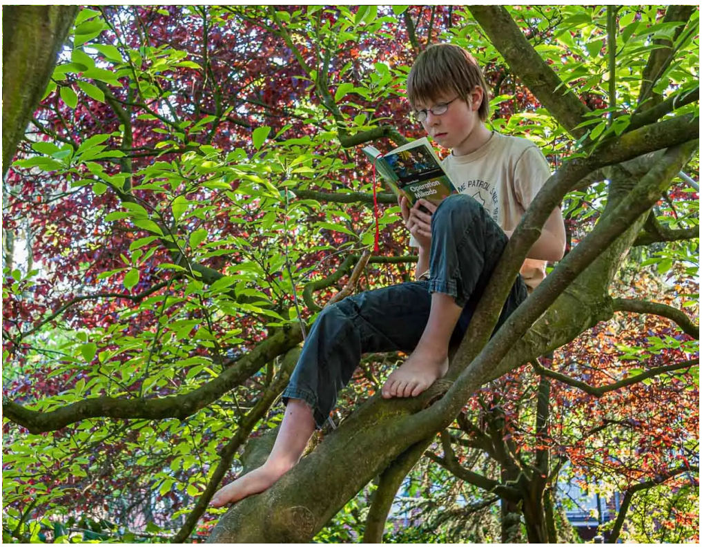
Reading in the magnolia tree

Do you also have a favorite tree? Mine is the magnolia tree. You could almost call it a family tree, as the magnolia runs through our lives. When I was looking for a wedding date, I came up with the idea of choosing this day after the blossoming of the large magnolia tree in front of our city's registry office. On April 3, 1997 the time had come and the magnolia blossomed for us in all its glory. Five years later and blessed with two young children, we were feverishly looking for a home. We took the large magnolia tree in the garden of our current house as a sign. This house suits us. Later, the magnolia was often used as a climbing and reading tree. Year after year, it blooms reliably around our wedding anniversary. What sounds like wild imagination, but is documented in writing, puts a crown on our tree story.